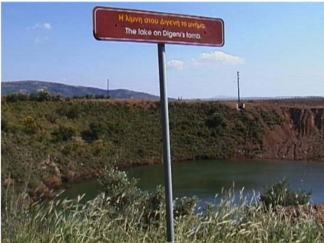
Digeni to Mnima Lake